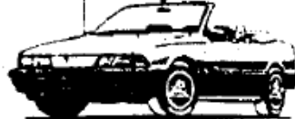
'91 SUNBIRD LE CONVERTIBLES LOADED W/P.W., P.L., STEREO, AND MORE