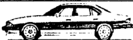
'92 BONNEVILLE S/E's LOADED W/P.W., P.L., TILT, CRUISE AND MORE