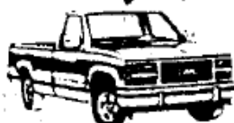
'91 G.M.C. CYCLONE 2,XXX MILES