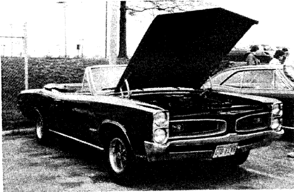
Paul's 1966 GTO Convertible at the 1991 Don Darr Car Display

I drove the car as it was for a year. The seals in the motor were dripping and making a mess on the garage floor. Since the motor was running fine, I pulled it just to replace all the seals and repaint it. Not knowing much about motors, I started to take it apart. When I pulled the crank to replace the rear main rope seal, I began to wonder if I was ever going to get this thing back together right. It went back together OK and runs fine but still drips oil.