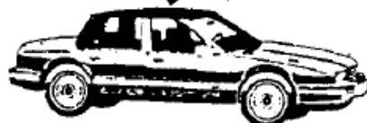
'91 CADILLAC SEVILLES 8 TO CHOOSE FROM